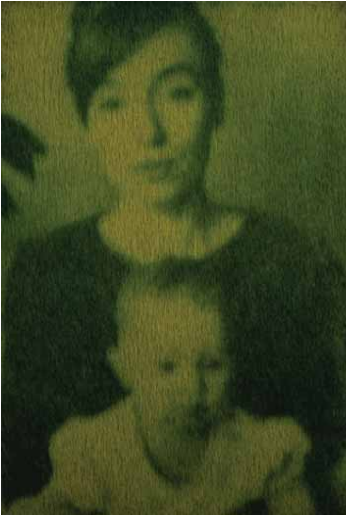
HEATHER ACKROYD AND DAN HARVEY, Mother and Child (negative). Staygreen grass and clay, 48 x 72 inches, 1998.

world's total forest cover in 1990 that vary by as much as 470 million acres, or 21% of the original estimate.