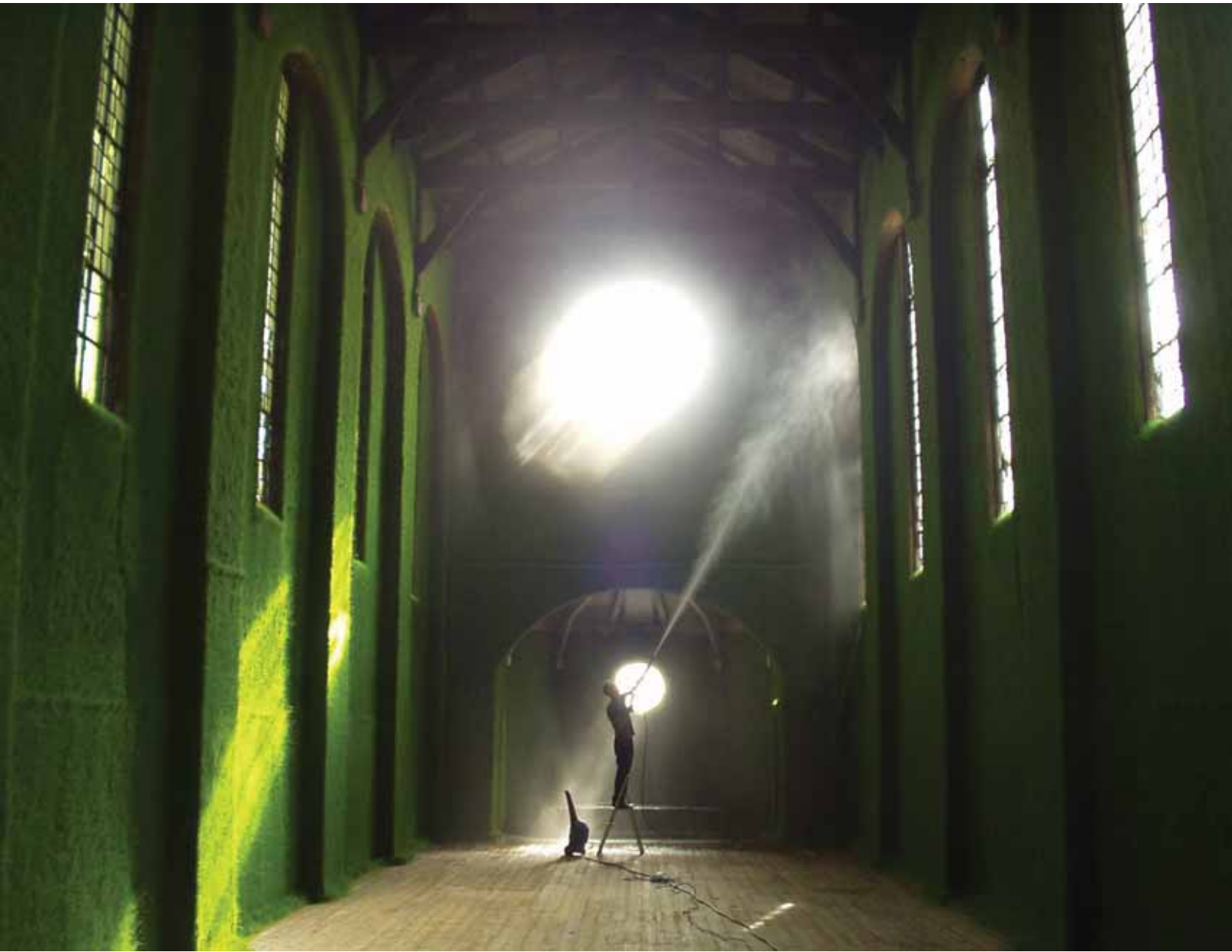
HEATHER ACKROYD AND DAN HARVEY, Dilston Grove . Installation using grass, clay, and water inside a de-consecrated and now derelict church, Bermondsey, London, England, 2003.