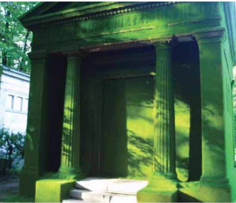
HEATHER ACKROYD AND DAN HARVEY, Life Drawing . Installation using grass, clay, and water on a derelict mausoleum, Riga, Latvia, 2004.

Perennial biofuel crops can help stabilize land cover, enhance soil carbon sequestration, provide habitat to support biodiversity, and improve soil and water quality.