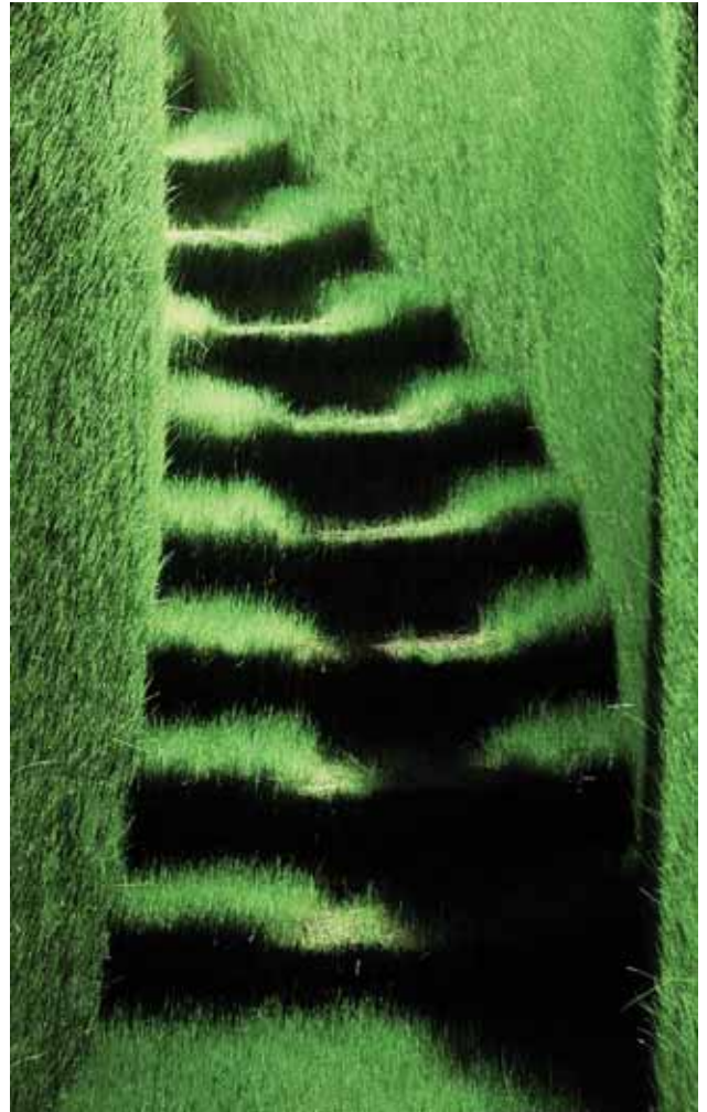
HEATHER ACKROYD AND DAN HARVEY, The Undertaking (detail). Section of installation using grass, clay, and water in a series of underground corridors and chambers beneath the Palais de Chaillot, Paris, France, 1992.

Third, many studies omit the larger problem of widespread global mismanagement of land. The recent arguments focusing on the possible deforestation attributable to biofuels use idealized representations of crop and land markets, omitting what may be larger issues of concern. Clearly, the causes of global deforestation are complex and are not driven merely by a single crop market. Additionally, land mismanagement, involving both initial clearing and maintaining previously cleared land, is widespread and leads to a process of soil degradation and environmental damage that is especially prevalent in the frontier zones. Reports by the FAO and the Millennium Ecosystem Assessment describe the environmental consequences of repeated fires in these areas. Estimates of global burning vary annually, ranging from 490 million to 980 million acres per year between 2000 and 2004. The vast majority of fires in the tropics occur in Africa and the Amazon in what were previously cleared, nonforest lands. In a detailed study, the Amazon Institute of Environmental Research and Woods Hole Research Center found that 73% of burned area in the Amazon was on previously